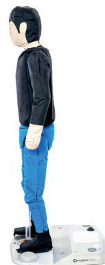
UFO nano ® with Pedestrian Adult target

Its modern stealth design featuring a sleek, robust metal surface makes the UFO nano ® invisible to the test vehicle's radar – a necessity for maintaining realistic test conditions.