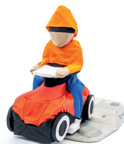
UFO nano ® with Playing Child target