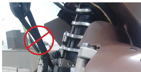
Figure 2 - Old Version Black Nylon Lifting Strap

Along with the new lifting strap, a new mounting bracket was created in order to prevent sharp corners from cutting at the strap. The new bracket uses the M5 holes above the first rib (figure 1). This design won't require customers to modify their existing THOR ATDs.