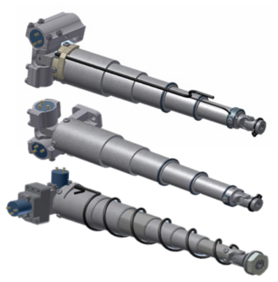
Figure 1: Three of the six varieties of devices used in THOR, upper thorax, lower thorax and abdomen, all right hand shown.

The previous slide end adaptor design for the THOR-50M Chest IR-TRACC required disassembly of the universal joint from the IR-TRACC free end and replacement with a ball joint to accommodate the existing mounts to the fixture slide. The