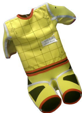
010-8000-GS Q10 Suit with Grid Markings

Apart from the grid, the suit has additional modifications in the horizontal zipper (a small band of red tape is used instead of a wider band of black tape as on the original suit), red tape to the neck, arm, and femur ends instead of white