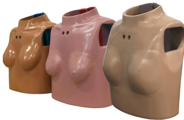
Figure 1 - From left to right: Denton, FTSS, and the SAE harmonized 5th female chest jackets.

The FTSS and Denton versions of the small female jackets are different interpretations of the specifications and vary mainly in the construction and placement of the breasts. To alleviate this variable, SAE organized a joint effort in 2009 between FTSS and Denton to create a jacket with one common geometry and breast location for both brands. The material and stiffness specs were not part of this original harmonization, but jacket stiffness is now called out in an SAE J document as a durometer measurement. The harmonized jacket shape was created purely from the federalized drawings and is the closest to those specifications.