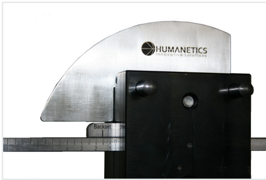
Easy reading of measurement values without additional tools