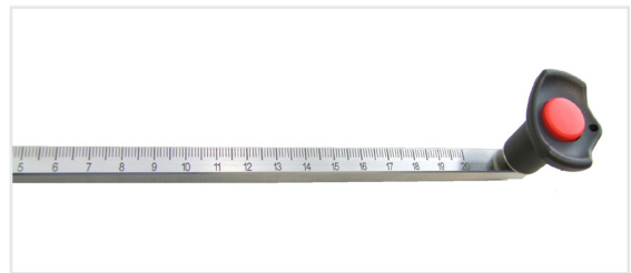
Scale secured against separation from device